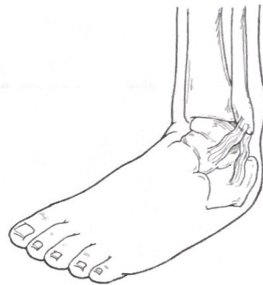
Injured ankle with laxity of ligaments

surgeon will ask you about any previous ankle injuries and instability. Then he or she will examine your ankle to check for tender areas, signs of swelling, and instability of your ankle as shown in the illustration. X-rays, CT scans, or MRIs may be helpful in further evaluating the ankle.